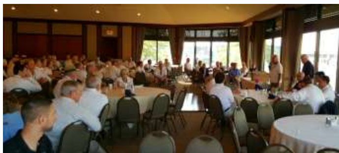
Middle Left: Saturday morning's 'Judges' Breakfast' with all in attendance.

Above: Boat judges separate to discuss details prior to walking the docks with our clipboards.