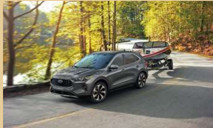
Smaller SUVs and crossover -vehicles are perfectly capable of towing some boats when equipped with the optional factory towing package.

That's because vehicle manufacturers set tow ratings based on extensive lab and field testing according to the Society of Automotive Engineers (SAE) certification guideline J2807 related to towing, which includes the proper items needed to tow a trailer safely with the vehicle being tested. That means using the factory-installed towing package.