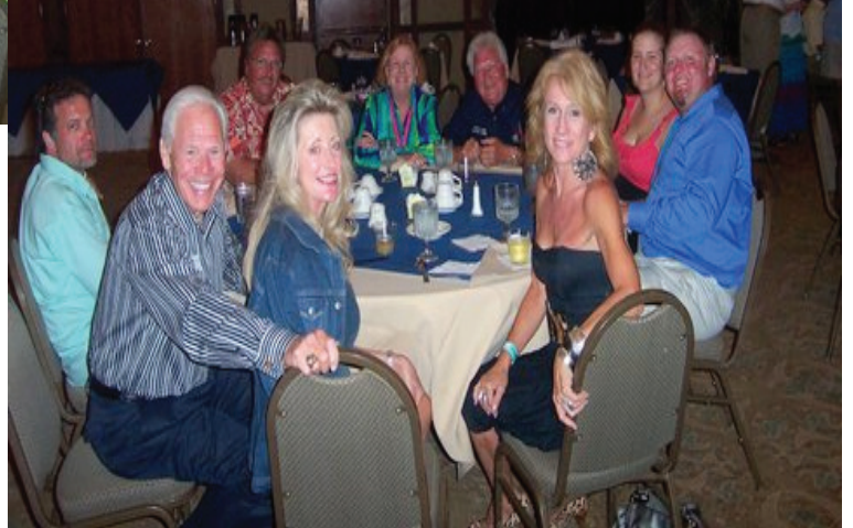
Above: Saturday night banquet. Below, workers appreciation party.