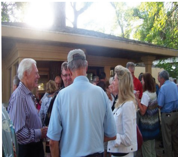
Thursday night's party at the Villa Capri restaurant.