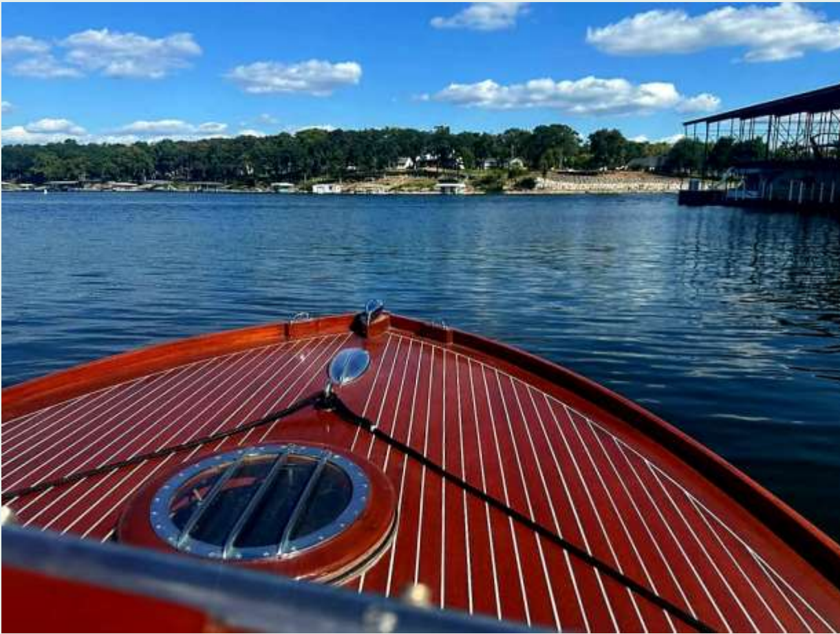
left A great view over the long deck of a big Sportsman.