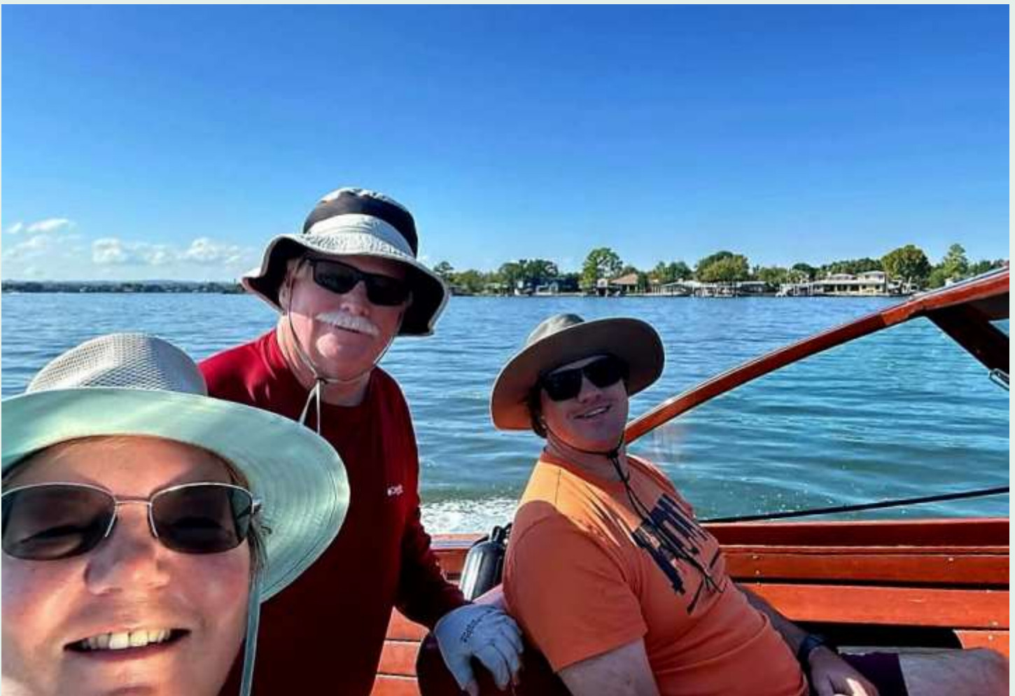
below Two generations enjoying the day.