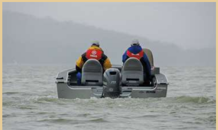
Fog is more common in colder weather, so make sure you can be seen and heard when visibility is reduced.

The colder you are, the more calories you'll burn to stay warm. Keep some nosh on board to help boost your energy, especially as air temps get lower or you're outside longer. It's also important to stay hydrated. You may not feel as thirsty as in warm weather, but you're still losing fluids. Having some food and nonalcoholic beverages (warm or cold) available will also come in handy if you find yourself waiting for assistance.