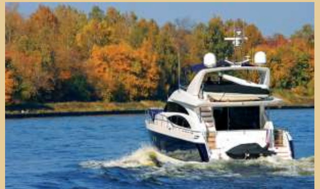
Many off-season boaters enjoy the promise of having the water all to themselves, perfect for leaf peeping.

Whether you're squeezing in one last outing before closing things up for the season, want to chase some different fish species, or you live in a region that doesn't freeze solid, extending your boating season may bring delights that fair-weather boaters miss. The promise of tranquility from having the waters mostly to yourself is always a big draw.