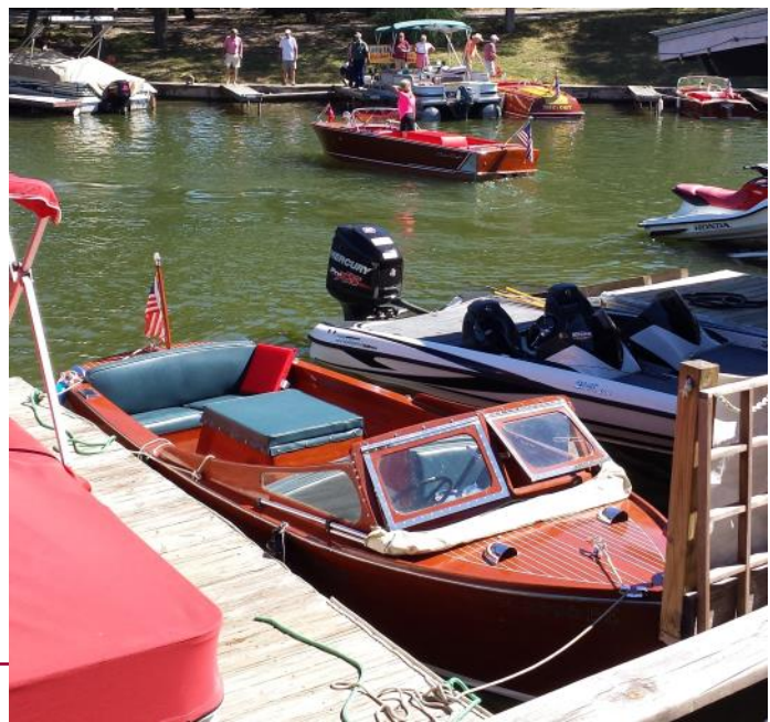
The Lake LBJ/Hillcountry Show started with the luncheon rendezvous at the Boater's Bistro at Sunrise Beach.