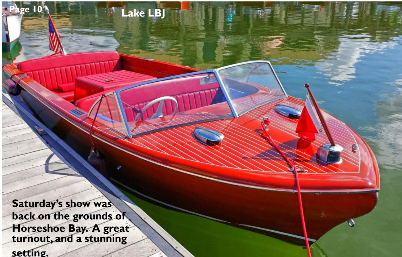
Saturday's show was back on the grounds of Horseshoe Bay. A great turnout, and a stunning setting.