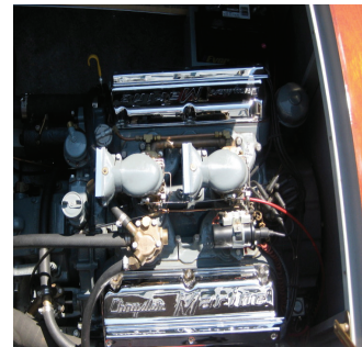
Ain't nuttin like a HEMI!

The show on Saturday was held at a new location this year, the Pier 121 Marina. There was ample dock space and the facilities included a covered outdoor bar and grill. As you can see in some of the photos, there was a good representation of Classic Glass in addition to wood. The Ride N' Show format gives members an opportunity to use their boats all day Saturday and Sunday morning.