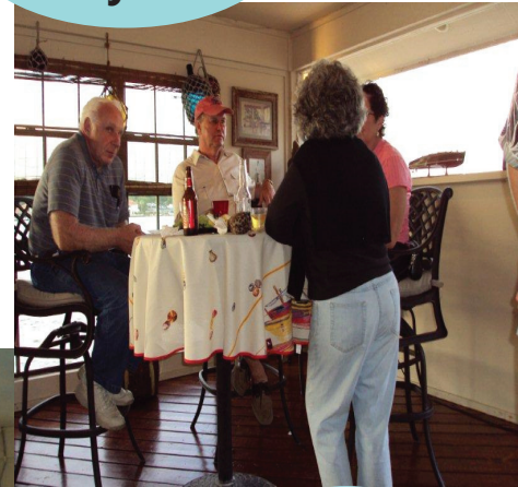
Saturday night in the boat house!