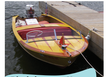
Biminis were the rage!