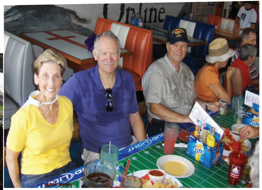
Wet and ready for the second half of the day.