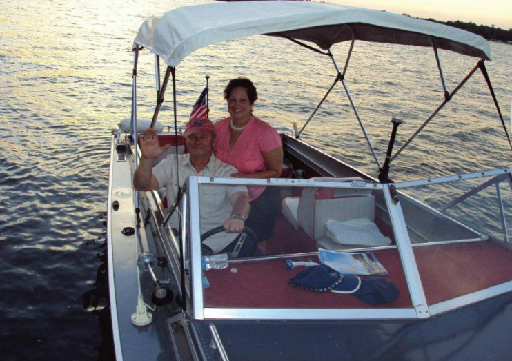
Departing from home in their cruiser.