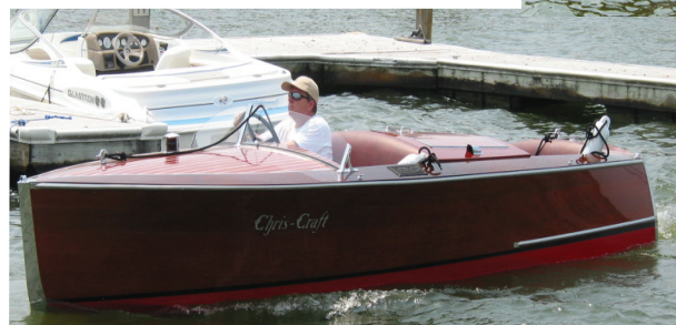
What a sweet boat!