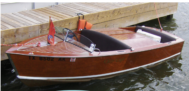
Unique late '50's Chris.