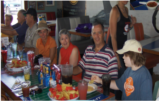
Sam's Boat for lunch.