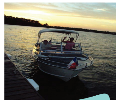
Yes. we arranged the sunset.